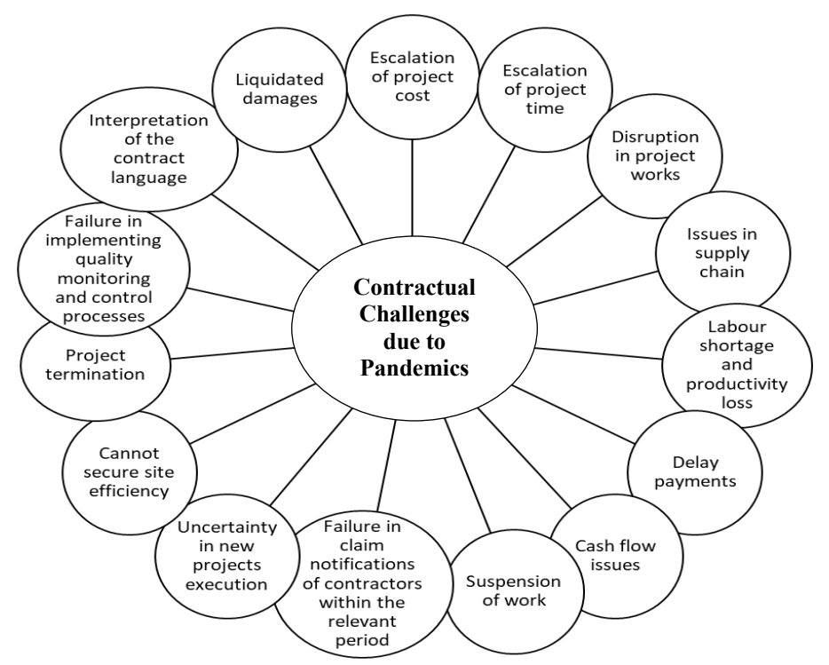
Figure 1: Contractual challenges due to a pandemic situation in construction industry

The government, as the client, should revise the contract to aid the contractor to claim losses for projects delayed due to lockdown, and the government should grant an Extension of Time (EOT) to cover the period of projects stopping (King, et al., 2021). Figure 1 presents the contractual challenges related to a pandemic situation in the construction industry identified by Jayathilaka and Waidyasekara (2022) through a systematic literature review.